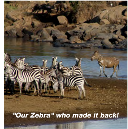
"Our Zebra" who made it back!