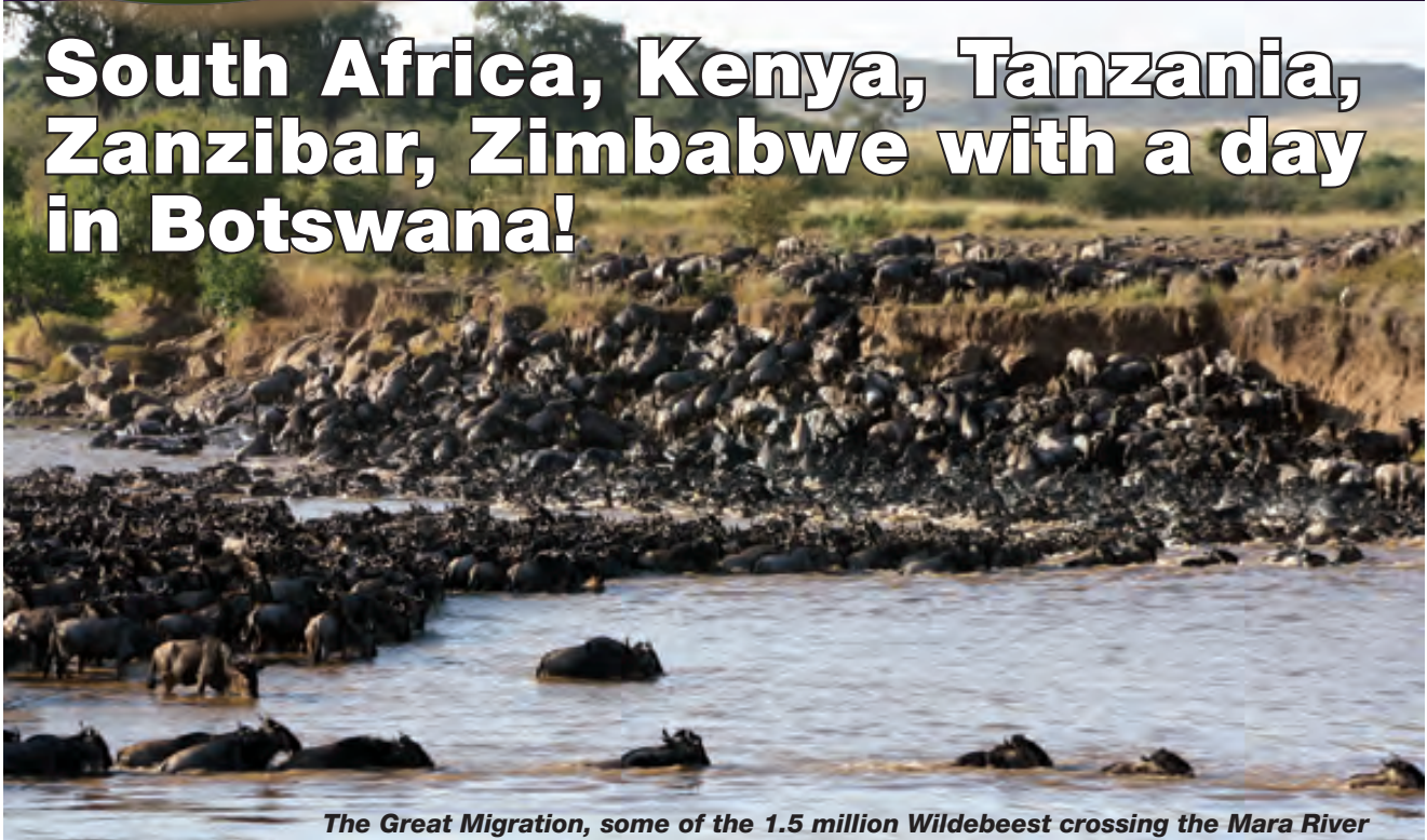
The Great Migration, some of the 1.5 million Wildebeest crossing the Mara River

On this Girls Own Adventure we visited so many wonderful places it is hard to do it justice in so few words, from beautiful Cape Town to Nairobi, then Lake Nakuru home to the world's largest flamingo population and hundreds of Great White pelicans. This park delivered all bar the elephant with leopard, lion, dozens of white rhino and the endangered black rhino, we even saw a tree-climbing lion! We were then transported across bone shattering roads to the breath-taking Masai Mara, west through the vast Serengeti to the Ngorongoro Crater on route we stopped to watch lion hunting, in fact we counted seventeen a huge pride, herds of zebra, elephant and giraffe grazing alongside. Late afternoon, our first glimpse