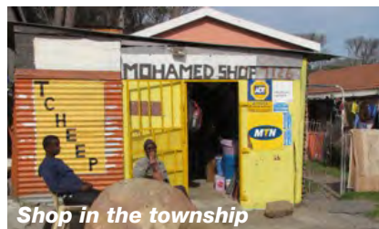
Shop in the township

Our third world experience began when we hopped off the bus and went on a walking tour of Imizamo Yethu Township in the Hout Bay area.