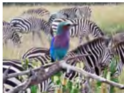
The famous 'Lilac Breasted Roller'