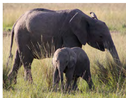
Elephants Masai Mara

“Most people dream of a journey through the plains of Africa; being up close to experience the elegant beauty of a ferocious lion, or the aged creases that mark the skin of an elephant, or even to hear the thundering sounds of a buffalo or wildebeest stampede. For most, this is a fantasy, but for me this has become a wonderful reality.