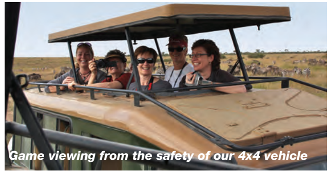
Game viewing from the safety of our 4x4 vehicle

While Africa is no longer the untamed wild of our grandmothers time, and our tents had bathrooms and Edwardian writing desks our experience was full of the richness and romance that makes Africa, Africa. And this is just a small part of the whole story.