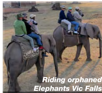
Riding orphaned Elephants Vic Falls