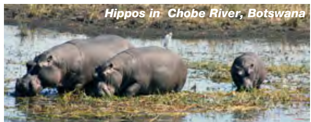
Hippos in Chobe River, Botswana