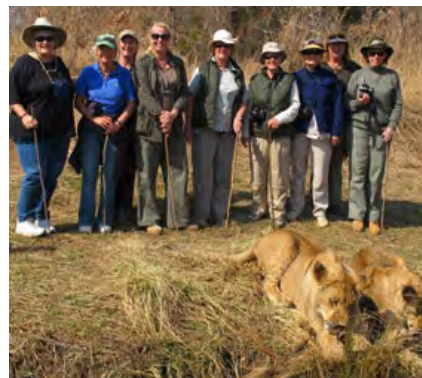
Walking with Lions Victoria Falls

“Thanks Africa for the trip of a lifetime!”