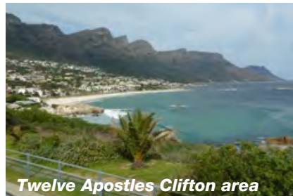
Twelve Apostles Clifton area

With a certain amount of neck-swivelling we could spot the Rhodes Memorial, the University of Cape Town and Newlands Stadium. This led us into an area of rather magnificent homes where beautiful gardens, huge fences and long driveways were features. Kirstenbosch Gardens were next and with such wonderful weather it was a shame we didn't have time to spend there. They are in a spectacular setting on the eastern slopes of Table Mountain and are readily acknowledged as one of the great botanical gardens of the world.