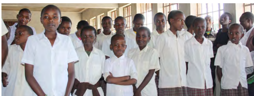
Some of the children at LDK School in Nakuru

“Thanks Africa for the trip of a lifetime!”