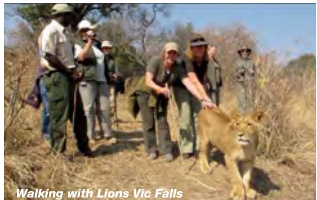
Walking with Lions Vic Falls