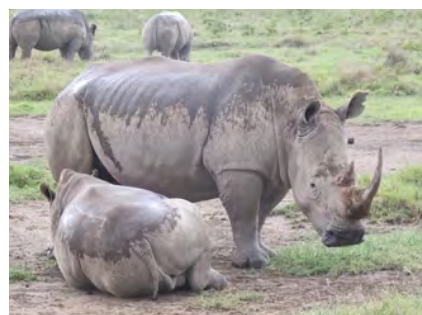
Rhino with suckling baby Lake Nakuru